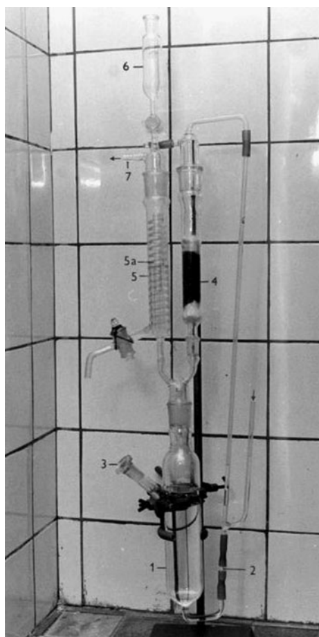
Fig. 1 Cultivation unit of a percolation apparatus. The apparatus contains: 1 reservoir with percolation solution 2 capillary tube 3 outlet for sampling of the percolation solution 4 soil sample 5 adsorption column with NaOH solution and (5a) glass spiral tube ensuring CO 2 retention 6 vessel for dosing NaOH and 7 vacuum pump outlet

activity [68]. Enzymes were detected in soils stored for 60 years and even in geologically preserved soils. According to Macura [95], urease and phosphatase activities were found in permafrost samples of 9,000-year-old peat. Primary attention was originally paid to urease [14, 26, 63, 74, 110, 158], phosphatases [38, 62], and dehydrogenases [163]. Methods for the determination of proteases [80, 89, 119, 131], L-asparaginase [42, 43, 180], L-glutaminase [44, 45, 67], L-histidine ammonia lyase [40, 60], and amidase [8, 20, 41, 66, 73] were also described. However, the enzymes degrading cellulose [61], hemicelluloses and other polysaccharides and the enzymes involved in lignin transformation are considered to be the most important in soil. While the enzymes involved in N, P and S acquisition are produced by a wide variety of soil microorganisms, and some of them are also secreted by plant roots, the production of several polymer-degrading enzymes is often ascribed to fungi [6, 114, 145, 157]. These enzymes comprise endoglucanase, cellobiohydrolase, \beta -glucosidase [7, 92], endoxylanase, endomannanase, \beta -glycosidases [10, 21], esterases [10],